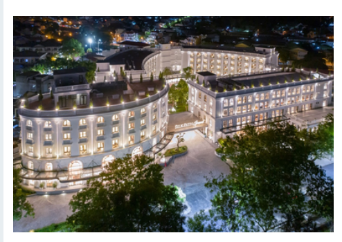
Silk Path Grand Hue Hotel