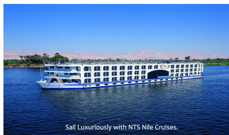
Sail Luxuriously with NTS Nile Cruises.