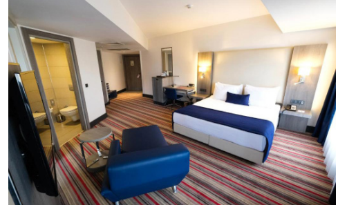
Romada Plaza Hotel