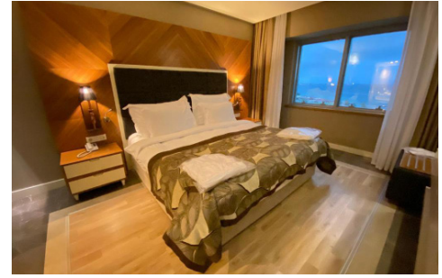
Kolin Hotel Canakkale