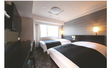
Tokyo Bay APA Resort ★★★★★