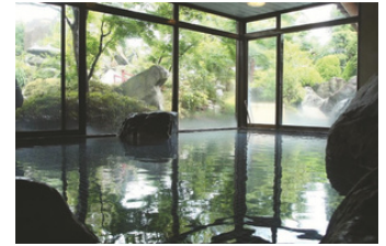
Heian Hot Spring Hotel ★★★★★