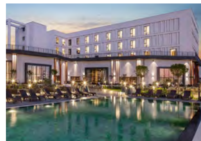
Double Tree Hilton Canakkale ★★★★★