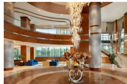
La Quinta by Wyndham Istanbul ★★★★★