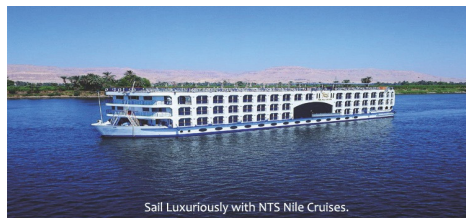
Sail Luxuriously with NTS Nile Cruises.