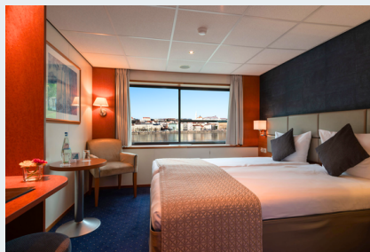
Deluxe Cabins with Large Opening Windows