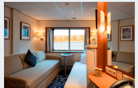
Standard Cabins with Windows