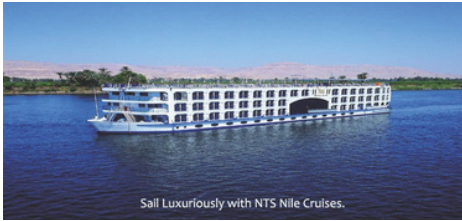
Sail Luxuriously with NTS Nile Cruises.