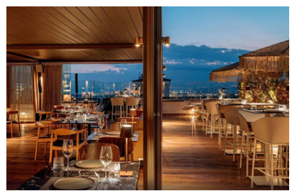
Brown Acropol Athens or equivalent \star\star\star\star