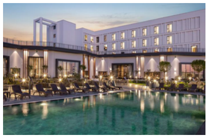
Double Tree Hilton Canakkale * * * * *