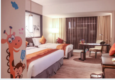
Narada Beijing Hotel ★★★★★