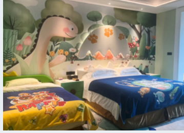
Wangfu Jinke Grand Hotel ★★★★★