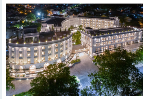
Silk Path Grand Hue Hotel