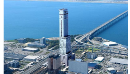
Odysis Suite Osaka Airport Hotel or equivalent