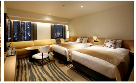
Sunshine Prince Hotel Ikebukuro or equivalent