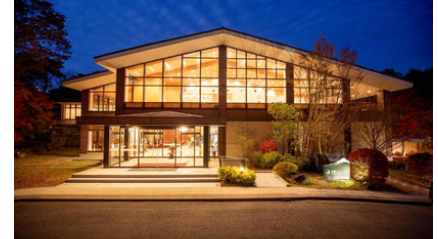
Motosu Phoenix Hotel Mt. Fuji or equivalent