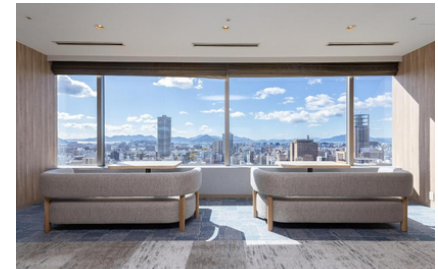
Mitsui Garden Hotel Hiroshima or equivalent