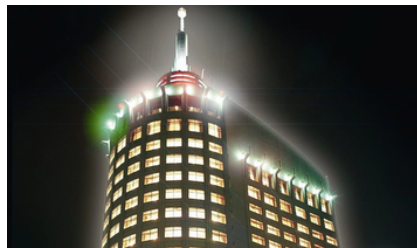
Hotel The Manhattan Tokyo or equivalent