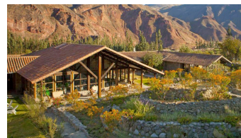
Tierra Viva Valle Sacred Valley or equivalent