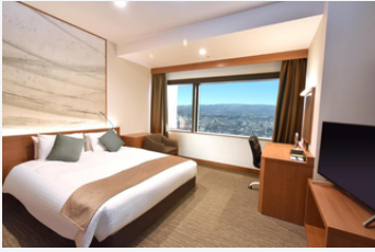
Odysis Suites Osaka KIX