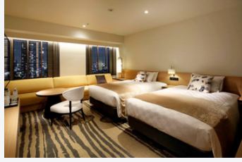
Motosu Phoenix Hotel Mt. Fuji