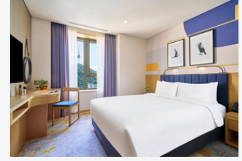
Voco Seoul Myeongdong