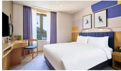
Voco Seoul Myeongdong or equivalent