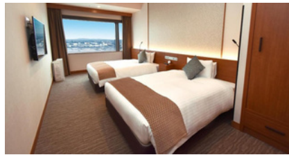
Odyssey Suite Osaka Airport Hotel or equivalent