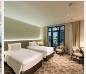
Rey Hanoi Hotel