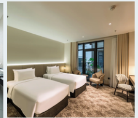
Rey Hanoi Hotel