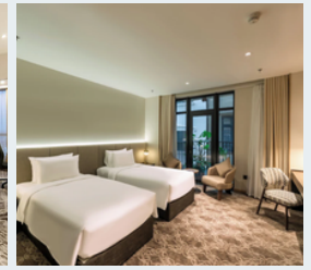
Rey Hanoi Hotel